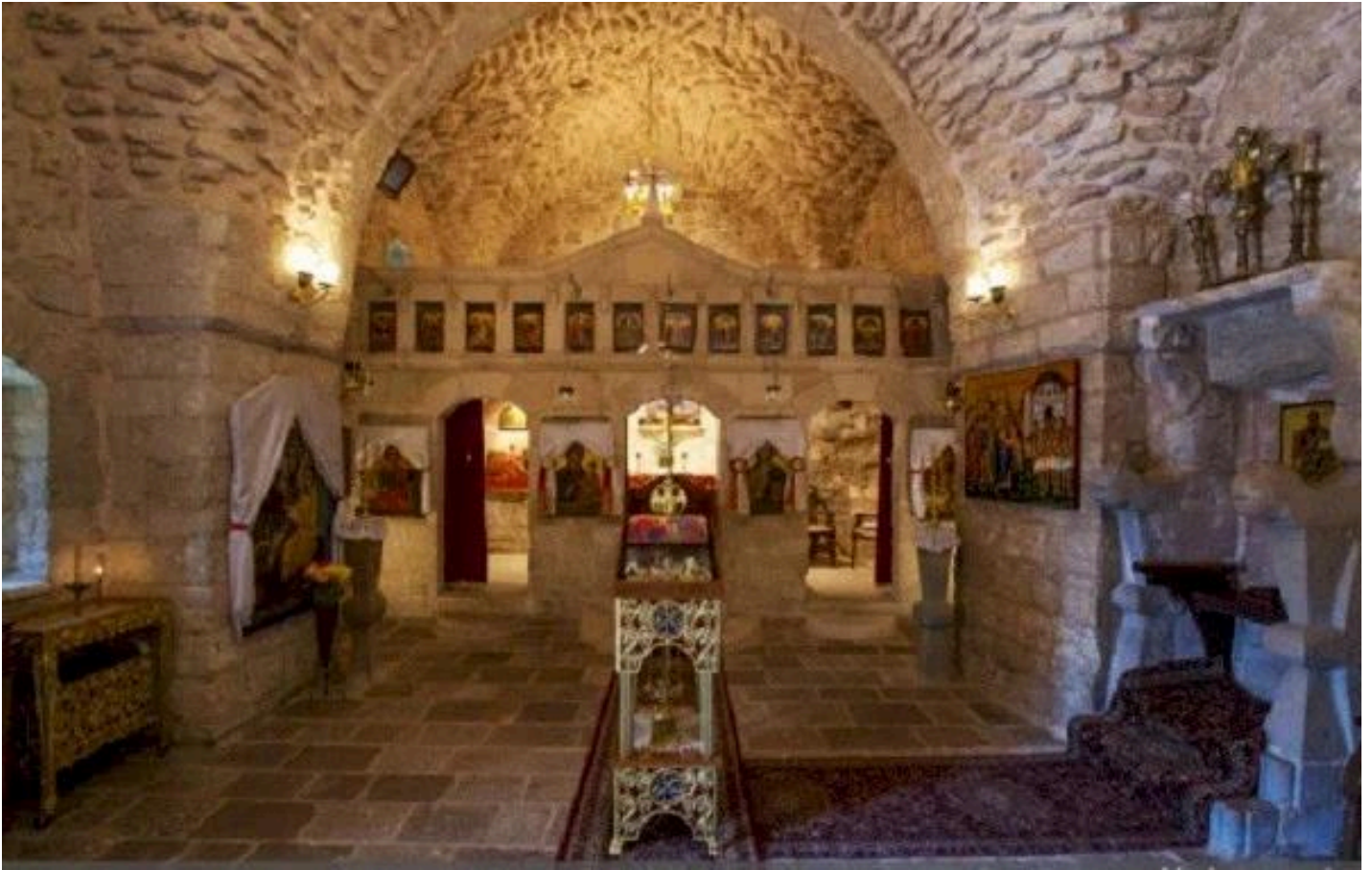
St. George's Church, Burqin on the West Bank.

This image shows the interior of the Church of St George, Burqin, reputedly the fourth oldest church in the world. Locally it is called the “Church of the Ten Lepers” as it sits over a cave where lived the ten lepers Jesus is said to have healed on the way to Jerusalem ( Luke 17: 11–19 ). That so ancient a church was dedicated to St George shows the importance of “The Great Martyr” in the Eastern Church from very early days.