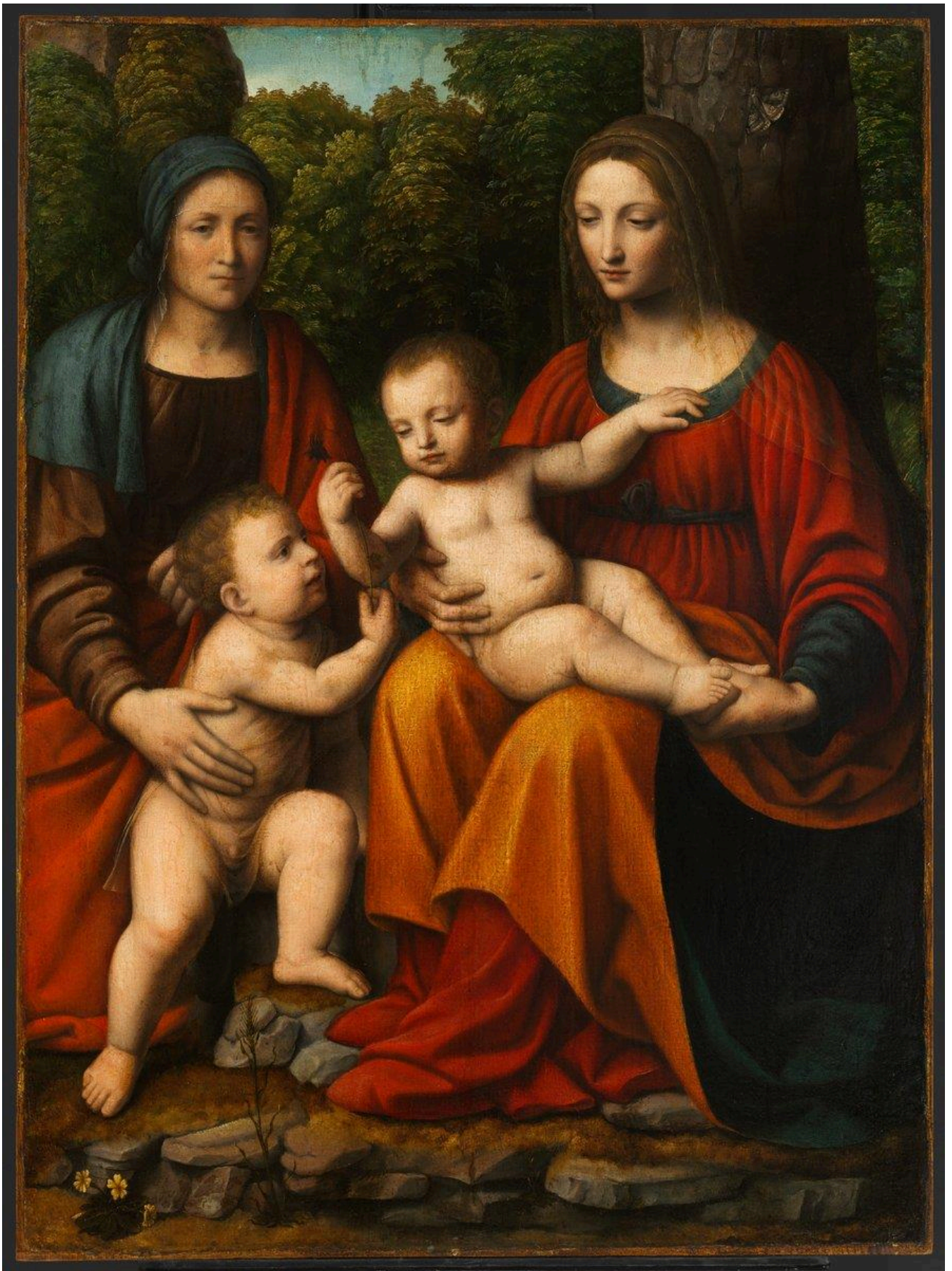
Virgin and Child with Saints John the Baptist and Elizabeth (c. 1520–5) Bernardino Luini, (1480–c. 1531) Museum of Fine Arts, Budapest