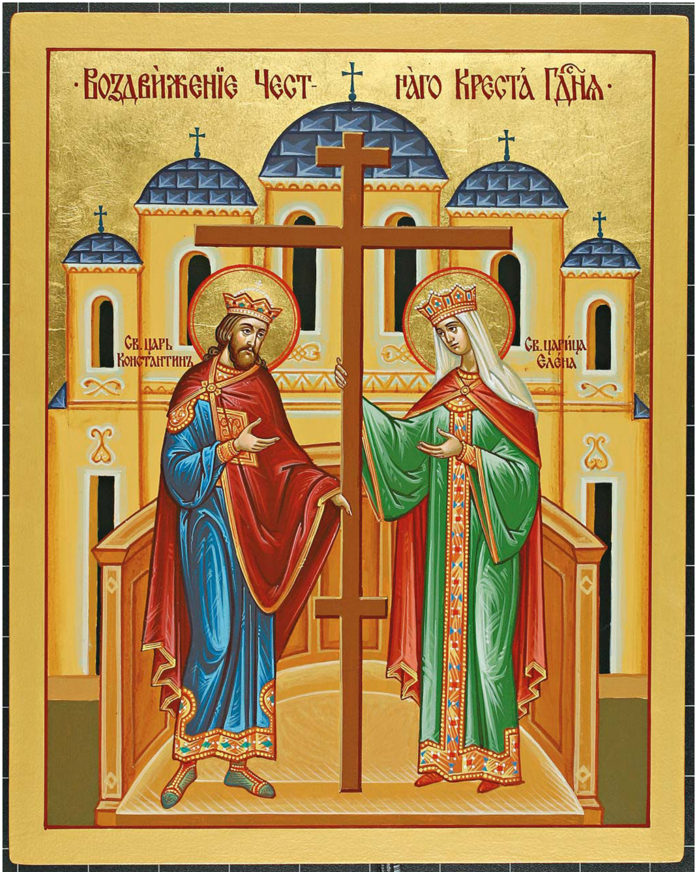
St Helena presents the True Cross to her son, Emperor Constantine, following its discovery