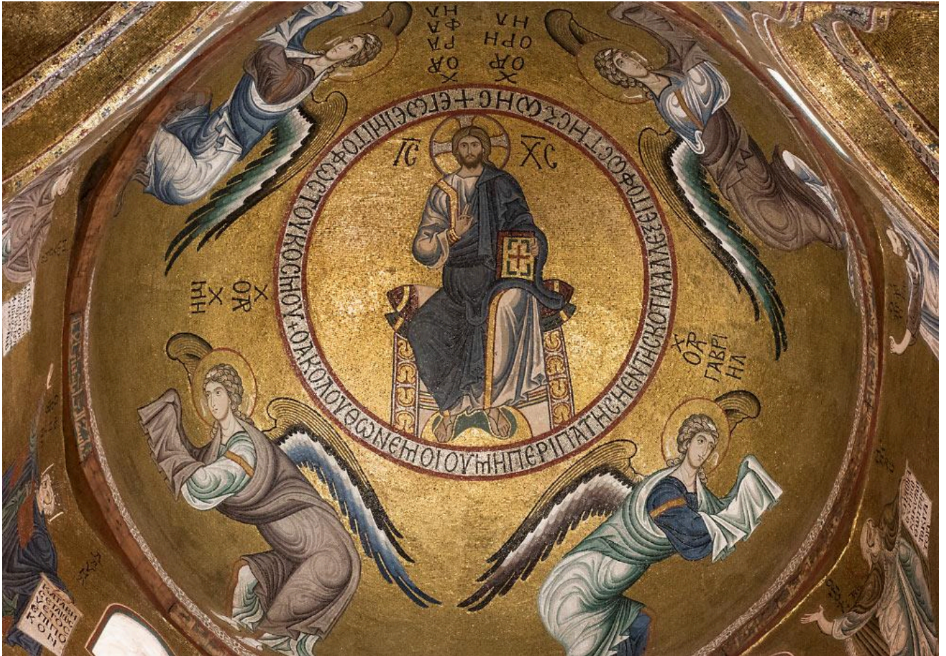
Christ Pantocrator in Martorama from Santa Maria dell'Ammiraglio, Palermo (c. 12 th century)

I December 2024 8:00 a.m. and 10:00 a.m.