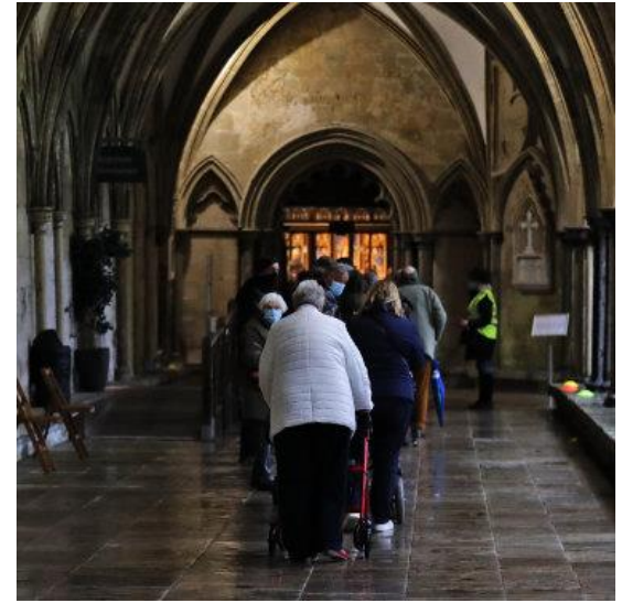
People queue for the vaccine in the cathedral's 13th century cloisters.

"And there could not be a more suitable environment to calm people's nerves. This is England at its best."